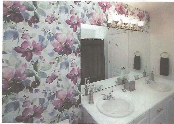
Opposite: This feng shui-inspired dining room features primary Fire and secondary Earth elements. Above left and right: The upstairs bedrooms are infused with Water and Metal, and Fire and Earth respectively; their shared bath (bottom right) uses Water, Metal, and Earth. Below right: The nursery crib faces the north wall in a room with Fire as its main element.

Two of the upstairs bedrooms—across the hall from each other in southeast and southwest positions—serve as guest rooms and share a bath. The east guest room has Metal and Water as its primary and secondary elements, so the walls are painted blue, and metal frames and lamp bases were incorporated to increase luck and health. By contrast, the west guest room's primary and secondary elements are Fire and Earth, so paintings with red hang on plum walls. "We loved the plum color," says Taylor, "because we had always intended to use that cream-colored tufted headboard in that room, and the plum color made that a perfect choice. The red in the paintings is really unexpected, but just looks great."