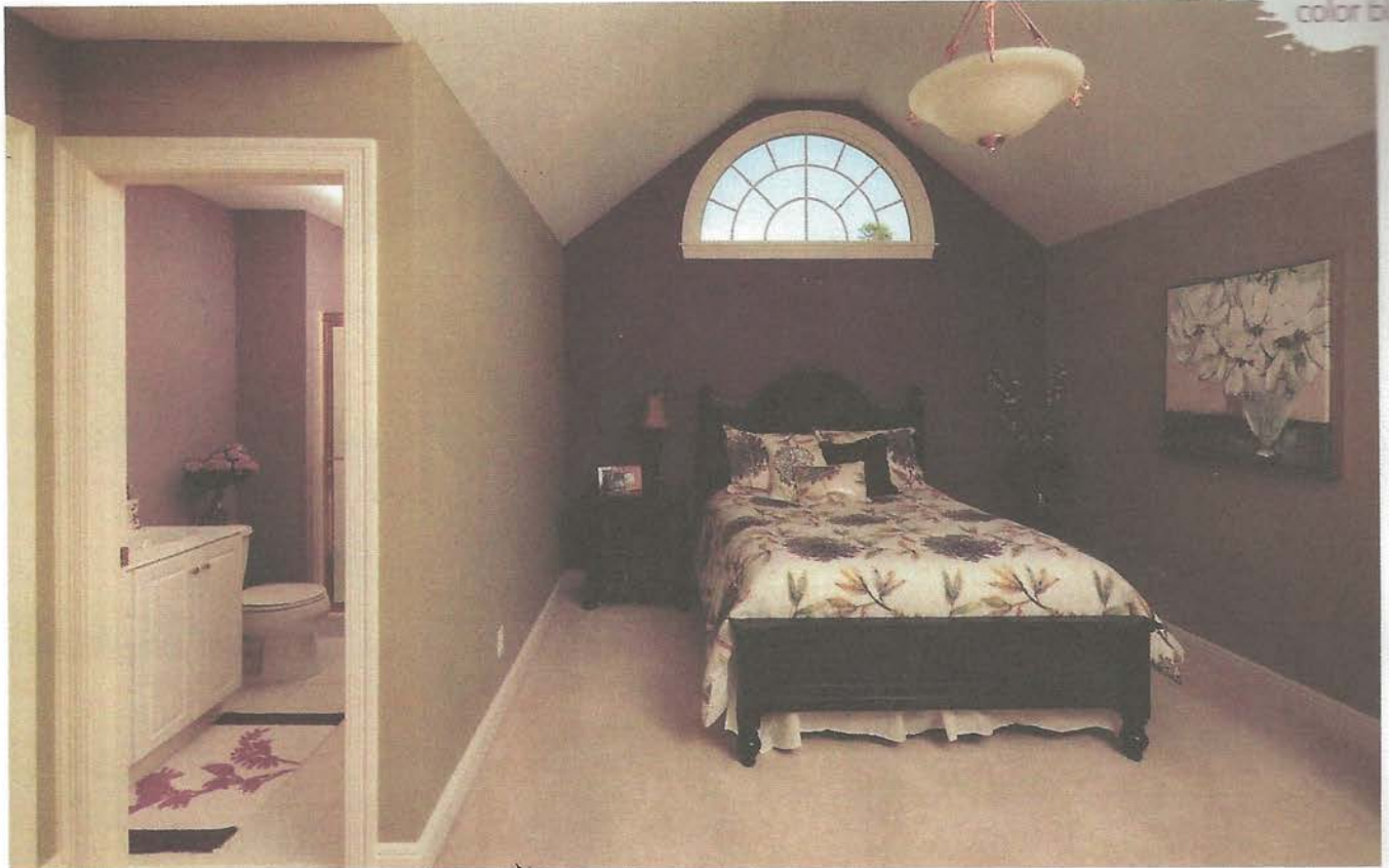
This room, which also called for Water, takes advantage of the element's soothing greens instead of blue.

As the holiday season approaches, fall into... the warmth of family and friends in your newly renovated kitchen